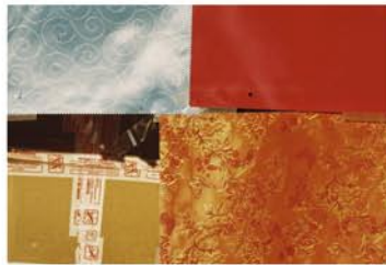
This page, from left to right: (1) Paris, France; (2) Cape Town, South Africa; (3 - 6) Berlin, Germany; (7) New York, USA; (8) Marrakech, Morocco; (9) Buenos Aires, Argentina; (10) Paris, France. Left page: Buenos Aires, Argentina.