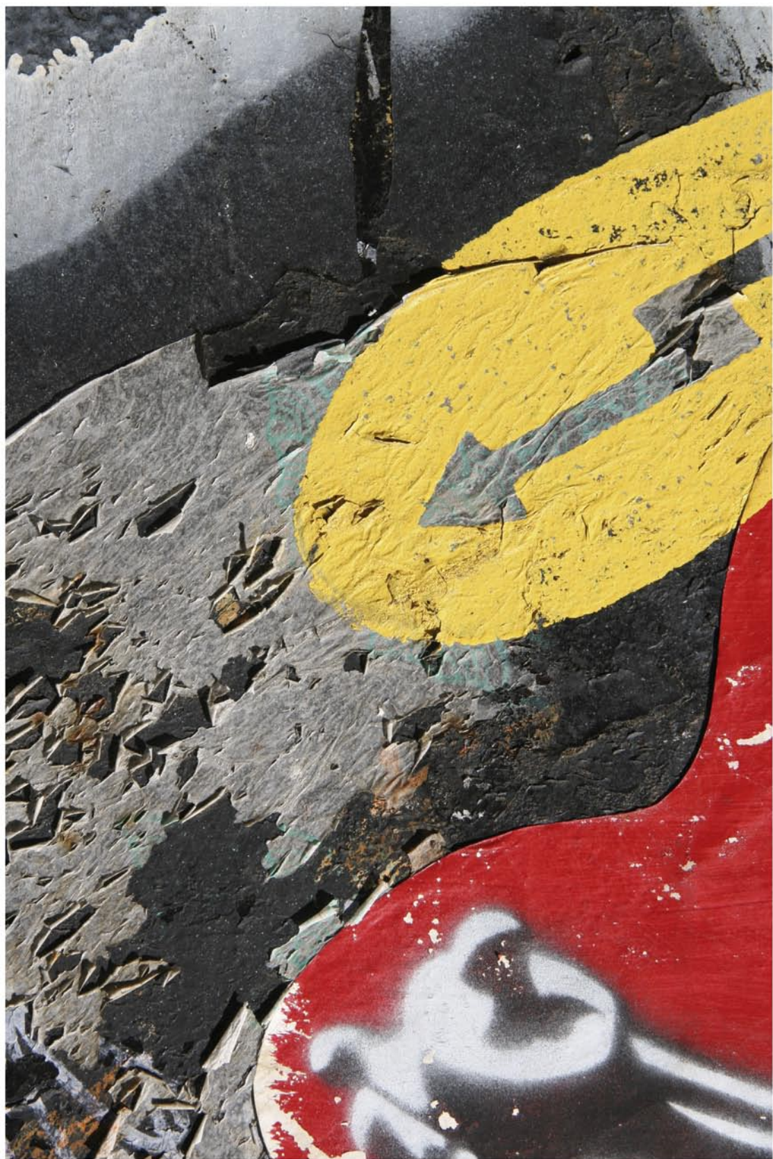
New York, USA | Photographer Axel Pfennigschmidt