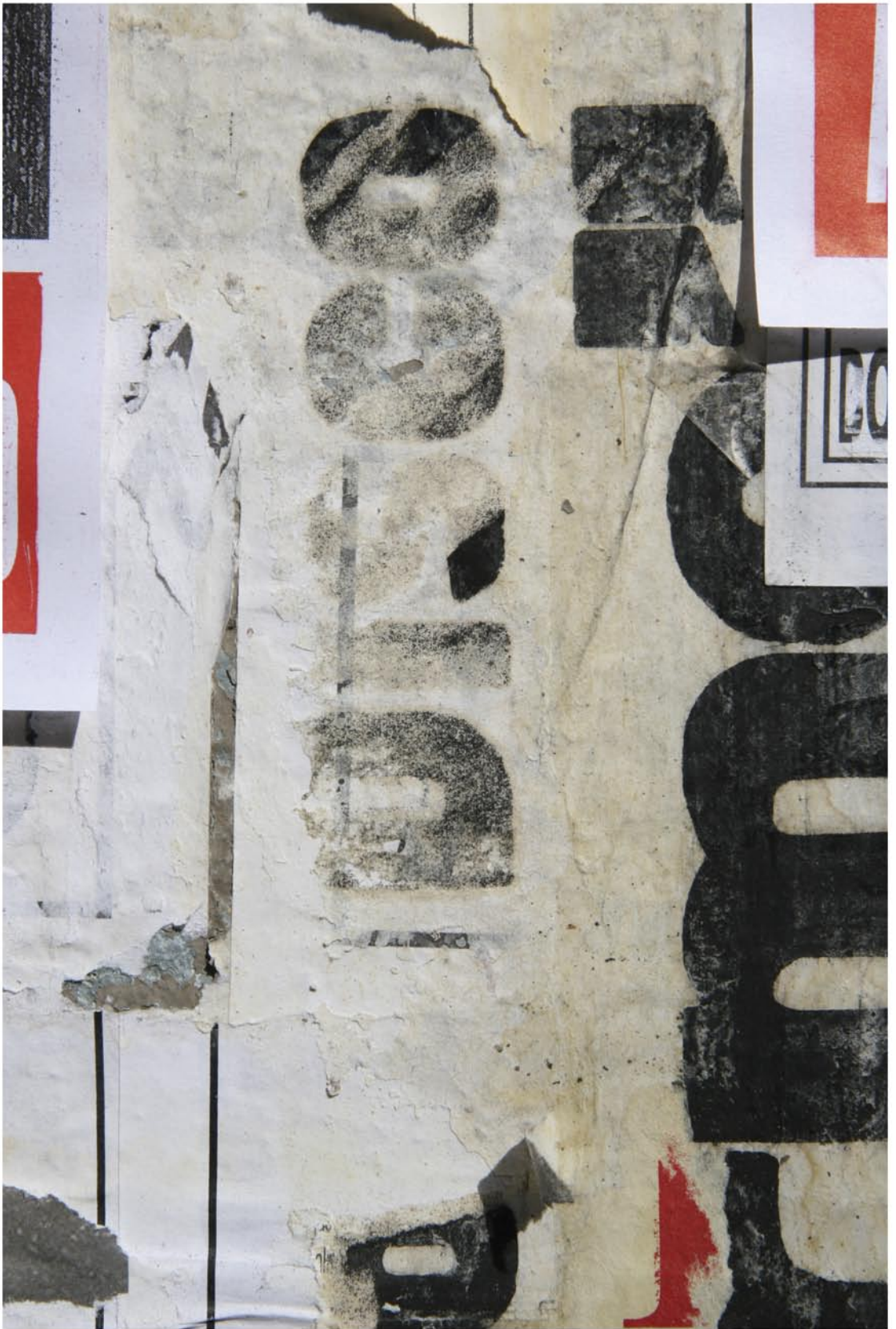
Buenos Aires, Argentina